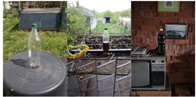
Fig. 2. Examples from the Liquid Volume and Level Dataset

599 images were collected, 539 of which were allocated for training and 60 – for testing.