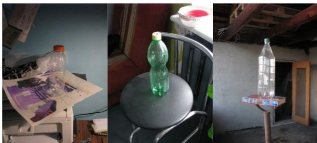
Fig. 1. Examples from the Container Volume Dataset

When solving the problem, two datasets were used: one to determine the volume of the container and one to determine the volume of liquid in containers. Data collection was carried out using professional cameras “Canon EOS m50 kit18-150mm” and “Canon PowerShot S5 IS”.