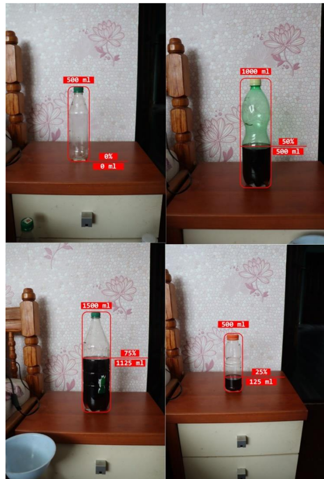
Fig. 5. Result of the system activity